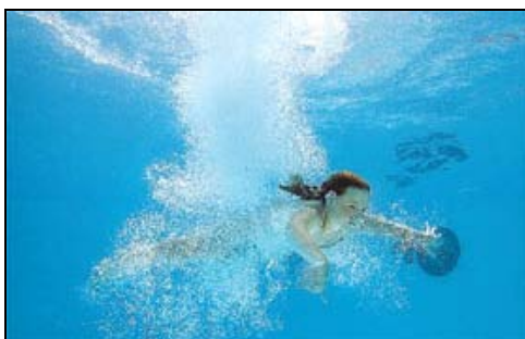
Eliza Hull stayed active by taking a summer swim program at the La Mesa Community Center yesterday.

Researchers measured physical activity by attaching small devices called accelerometers to the waistbands of about 1,000 children in 10 cities. The purpose was to accurately measure the youngsters' exercise levels, rather than rely on estimates from them or their parents.